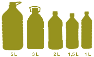
5 L 3 L 2 L 1,5 L 1 L