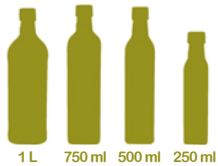
1 L 750 ml 500 ml 250 ml